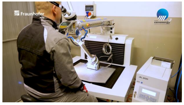
Figure 2 - Production of battery cells at Fraunhofer IKTS Hermsdorf pilot plant facility

In order to confirm the precise alignment of all components following the welding closure of each prototype cell, a thorough examination is conducted using an industrial micro computed tomography ( \mu CT) scanning system. This ensures the verification of filling height, composition, alignment, and the behavior of cathode material post cell initialisation. Upon successful completion of the \mu CT quality assurance, individual cells undergo charge and discharge performance tests, all of which have demonstrated satisfactory and as expected results thus far. As of now, fifty percent of the necessary cells have been successfully produced, showcasing excellent progress. Reject or defect rates have been low and with expected limits.