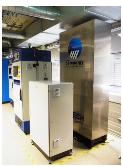
Figure 4: Delivery of the battery casing and heat loss testing at Fraunhofer IKTS Dresden