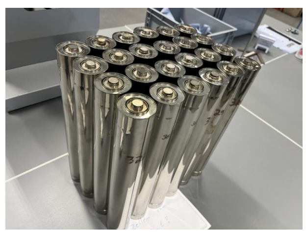
Figure 3 - Some of the completed battery cells waiting performance testing