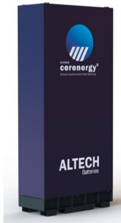
Figure 2 – Battery Pack with cover