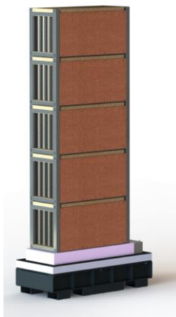
Figure 1 – Internal with cell frames