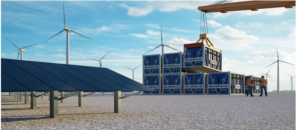
Figure 4 – 1MWh GridPacks

The stackable feature, coupled with the "plug and play" design, makes the GridPacks the obvious choice for BESS solutions to meet any future energy storage requirements. The Altech GridPacks are also designed without the requirement for any moving parts such as cooling fans, which are typically found in lithium-ion battery mega packs. This is a notable advantage, as end-users have raised concerns about the noise generated by mega packs, preventing them from being placed near residential areas. With the absence of any moving parts, the Altech GridPacks are practically maintenance-free and completely noise-free in operation, making them an ideal solution for noise-sensitive environments.