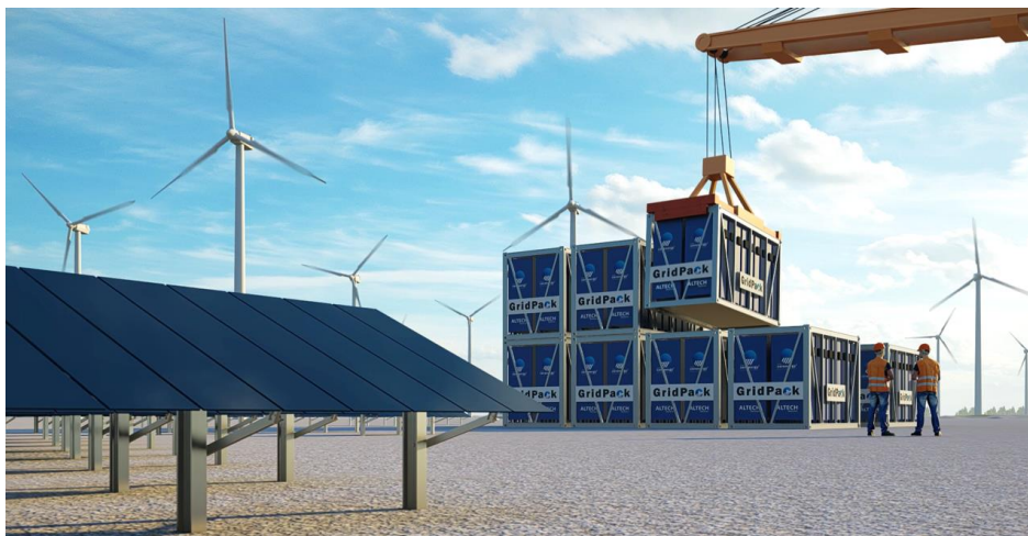
Figure 2 – Stackable and all-weather Altech 1 MWh GridPacks

Furthermore, the Altech GridPacks are designed without the requirement for any moving parts such as cooling fans, which are typically found in lithium-ion battery mega packs. This is a notable advantage as end-use customers have raised concerns about the noise generated by mega packs, preventing them from being placed near residential areas. With the absence of any moving parts, the Altech GridPacks are completely noise-free operation, making them an ideal solution for noise-sensitive environments. Finally, GridPacks are extremely low in maintenance costs over the battery life.