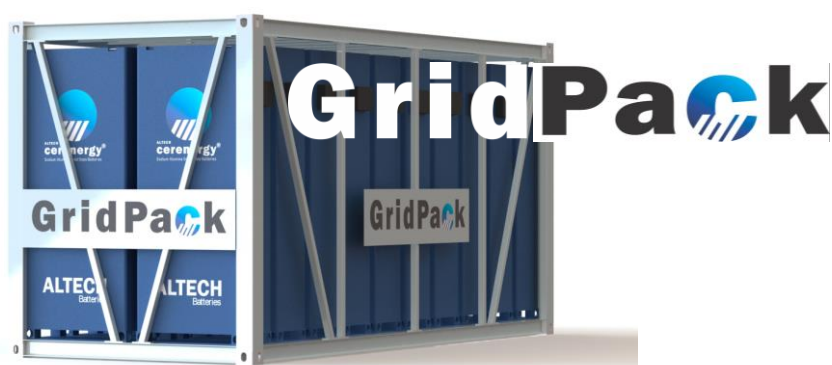
Figure 1 – 1.0 MWh GridPack (ABS1000)

Altech Batteries Limited (Altech/the Company) (ASX: ATC and FRA: A3Y) is pleased to advise that, in relation to its battery joint venture with Fraunhofer, it has launched the design for the CERENERGY® Sodium Alumina Solid State (SAS) 1.0 MWh GridPack (ABS1000) destined for the renewable energy and grid storage market. Based on preliminary discussions with potential off-takers and to minimise on site installation of individual ABS60 60KWh battery packs, a pre-installed solution has been launched. Each GridPack will have up to twenty 60 KWh battery packs installed and connected to pack power management system. Every GridPack has a distinct rating of 600 volts DC and 100 Ah, and it can be arranged in series (cluster or array) to achieve the required rating of several thousand KWs for grid functioning. A video in relation to this can be viewed on Altech’s website.